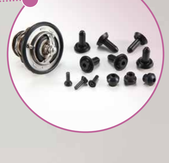
Table: Cooling System