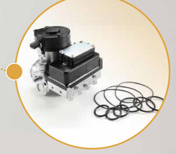
Table: Braking System

Seals in braking system are the most "system critical" automotive components. GMORS understands your concern and need. We ensure you a reliable control of braking function by providing you with optimum sealing solutions. We can meet requirements for hydraulic, pneumatic circuits, and system control. GMORS strict process control is to assure seals of working conditions like compression set, stress, strain, creep and etc. GMORS also increase seal's friction and wear in order to maximize the service life.